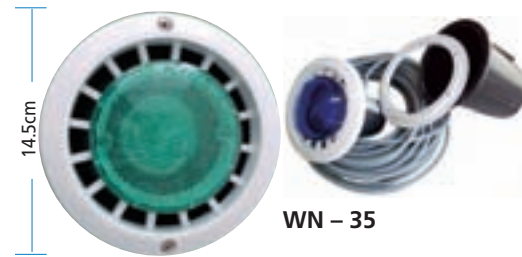
WN - 35