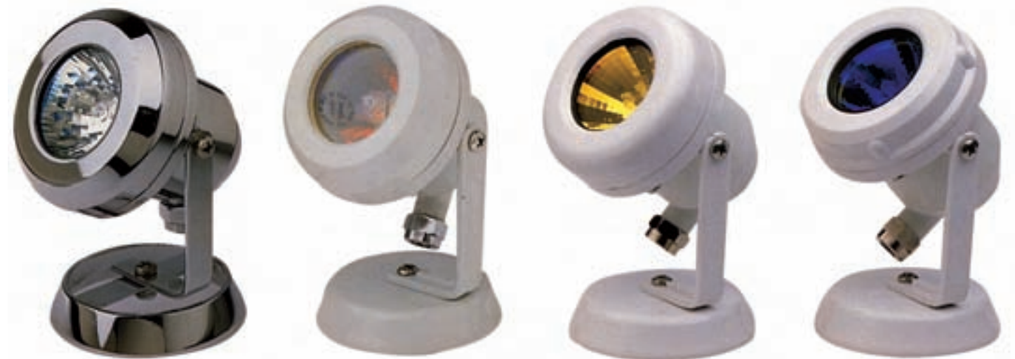
ULF - 1