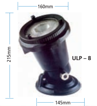
ULP - 8

Waterjet's new Underwater Plastic Fountain Light is ideal for illuminating fountains and ponds. Made in white or black thermoplastic glass-fibre reinforced polyester, suitable for high heat emission. Base with metal support to allow the light to stand upright. Supplied with 2 cable outlets for series connection and 2.5m of cable. Special lengths of cable on request. Colour lenses available in red, green, yellow and orange.