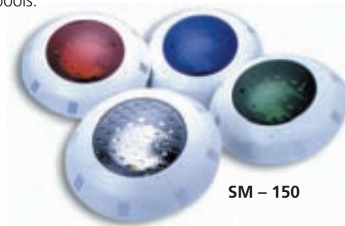
SM - 150