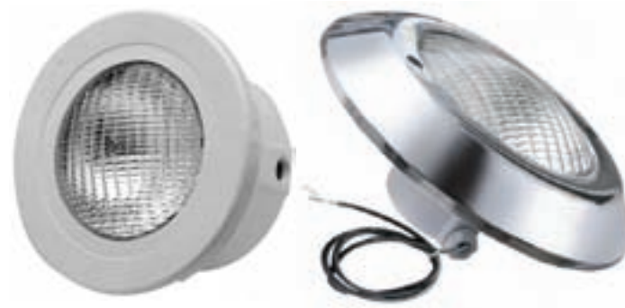
ULP - 300