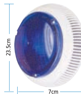
SM - 100